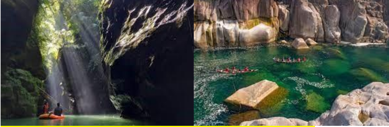
2<sup>nd</sup> Day: Shillong - Mawlynnong – Dawki – Transfer (Dt-30<sup>th</sup> October)

On arrival at Guwahati Lokpriya Gopinath Bordoloi Airport/ Railway Station and meet our representative who will also be your travel guide throughout your journey. After that, proceed to Shillong. Shillong is known as Scotland of the east. En route, visit Barapani (Umiam Lake) Arriving at Shillong check in to the hotel and overnight stay at Shillong Hotel.